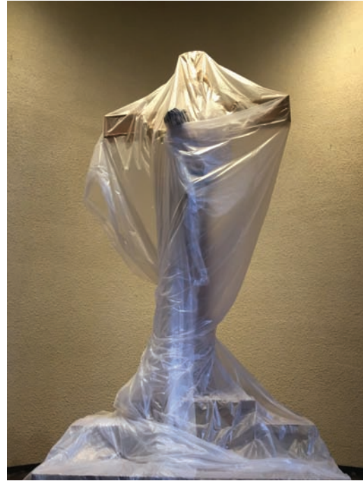
Our St. John Brebeuf Cross is shrouded as we undertake repairs in the church.